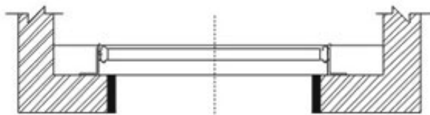
VERTICAL SLIDING DOOR LANDING